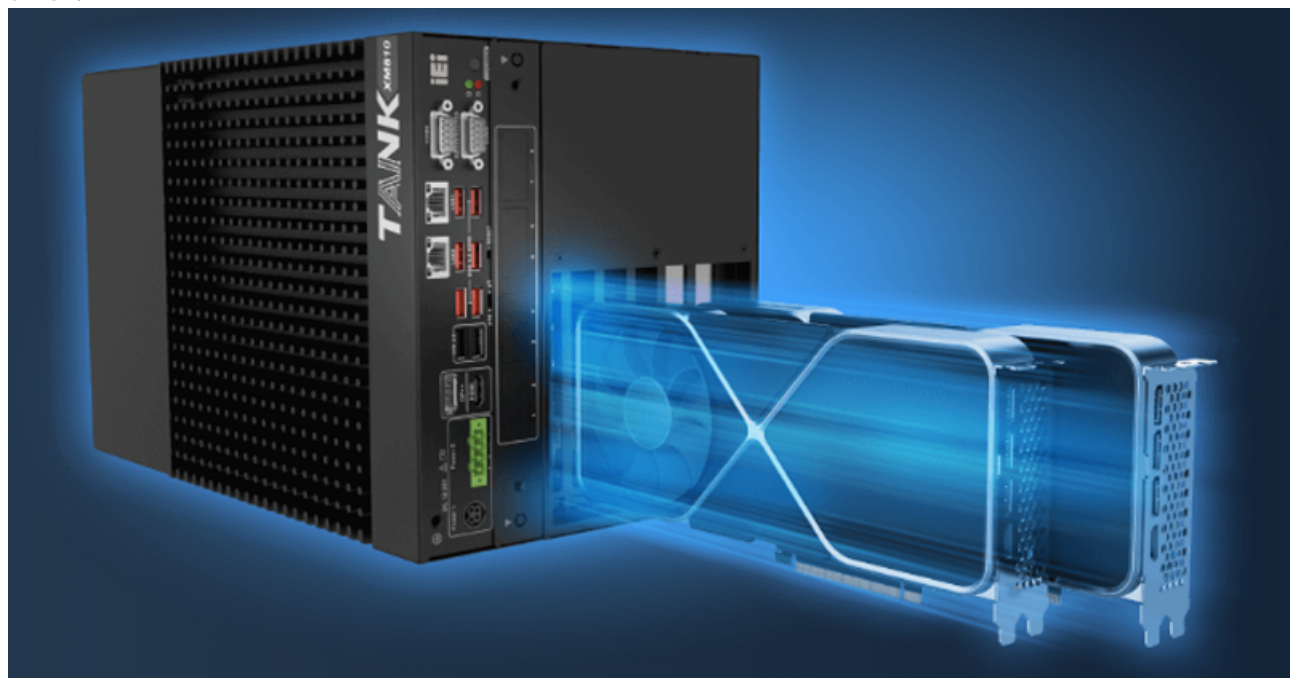
Dual-Power Input Enables Performance Upgrade

*Please choose the corresponding eBPs, TXCBP-XM81-G1-PW for TXC-XM81-G1 and TXCBP-XM81-G2-PW for TXC-XM81-G2.